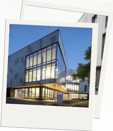
University Centre wins 'Most Considerate Site' Award