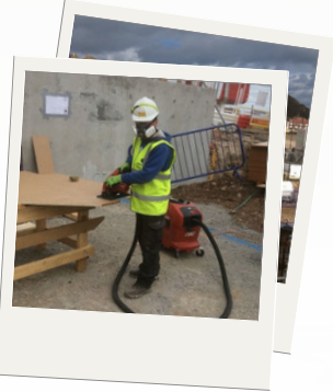
Investing in health and safety