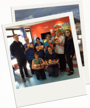
An egg-cellent surprise for children at Airedale Hospital!